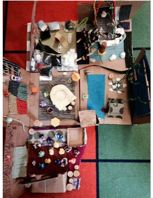
Complete model with all group pieces arranged together, forming one dream early childhood classroom.

As all of the grades finish up their end of the year projects in Think Tank stay tuned to my blog for a wrap-up and lots of pictures!