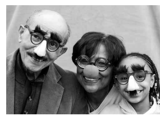
The Social and Emotional Learning Committee promotes SEL through activities like Operation: GRAND , an event to honor our children's relationships with their elders.

Responsive Classroom. This approach to teaching consists of classroom and schoolwide practices for deliberately helping children build academic and social-emotional competencies within a strong and safe school community. Everyone at Maury is expected to treat one another with kindness and respect. Each month, the whole school joins together for a Morning Meeting where different classes take turn leading and students are recognized for being empathy leaders.