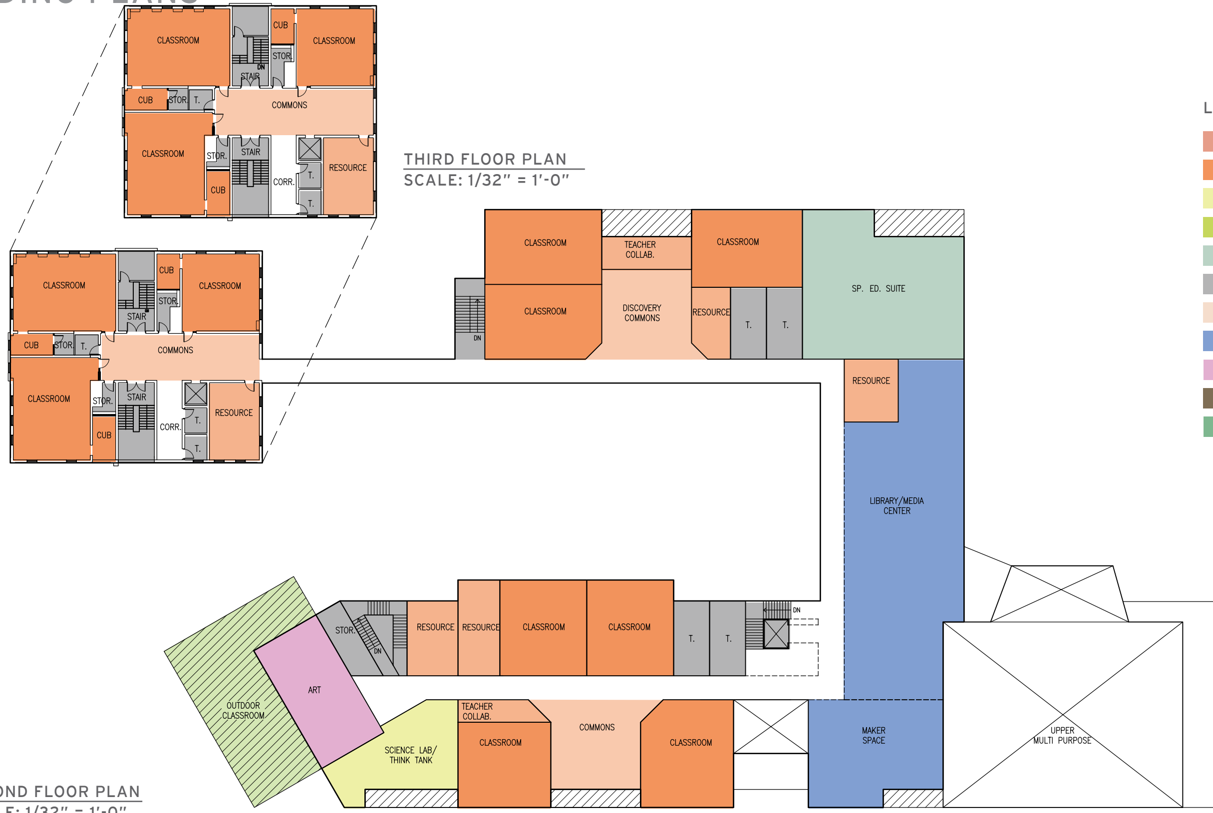
SECOND FLOOR PLAN SCALE: 1/32" = 1'-0"